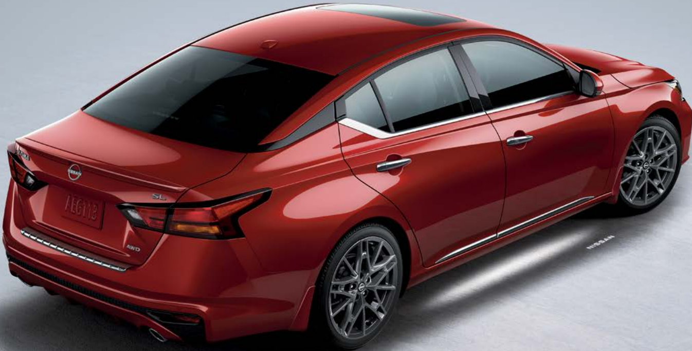
Nissan Altima® SL shown in Scarlet Ember Tintcoat with 19" Aluminum-alloy wheels, Splash Guards (4-piece set), Exterior Ground Lighting w/ Logo, Chrome Body Side Moldings, Chrome Rear Bumper Protector, and Rear Spoiler.

For more information and to shop online for Altima® Genuine Nissan Accessories, go to bit.ly/23Altima-Accys